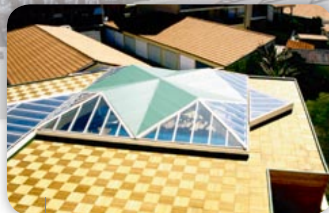
Restaurant Deleuil | Lacanau AlkorPlan® L - 2001