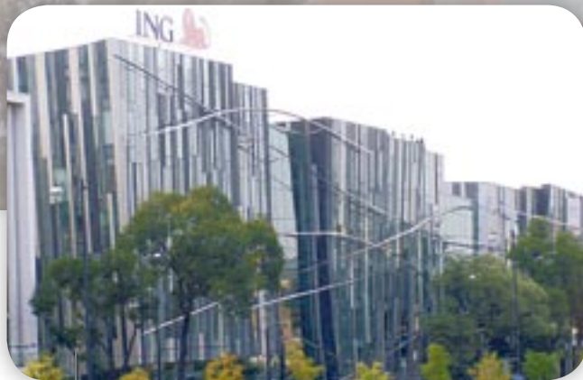
ING Center | Budapest AlkorPlan® F - 2002