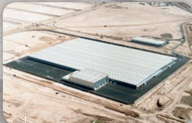
Zara Logistics Center | Zaragoza AlkorPlan® F - 2002 (ca. 114.000 m 2 )