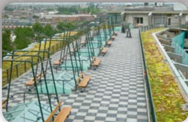
Groothandelsgebouw | Rotterdam (NI) AlkorPlan® L - 2005