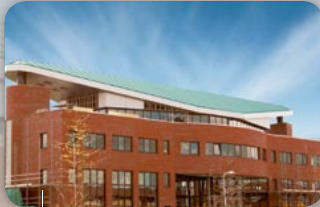
Kantoren | Capelle aan de IJssel (NL) AlkorDesign® - 2005