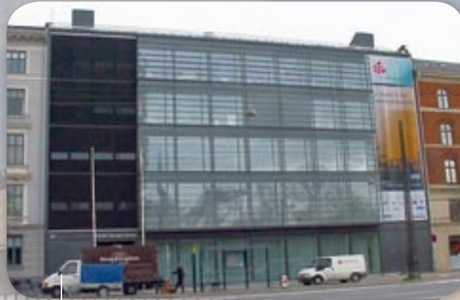
Design Center | Copenhagen (Dk) AlkorPlan® F - 1999