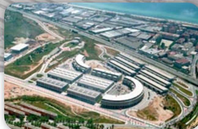
Les Guixeres | Badalona AlkorPlan® F - 2002-2004