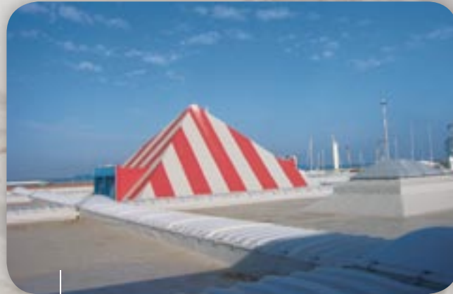
Mercato Ittico | Viareggio Lucca AlkorPlan® F - 2005