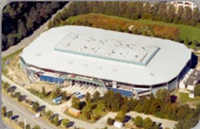
Vlaams wielocentrum Eddy Merckx | Gent (B) AlkorPlan® F - 2005