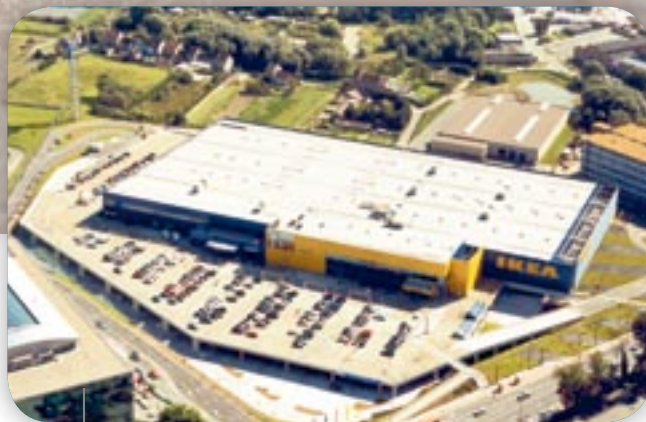
Ikea | Anderlecht (B) AlkorPlan® F - 2004