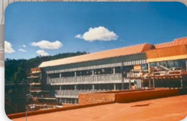
Office Building | Tønsberg (Dk) AlkorDesign® - 2000