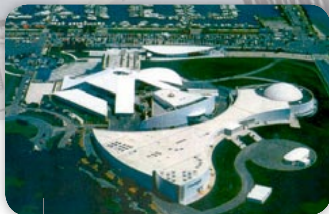
Océanopolis | Brest AlkorPlan® A - 2000