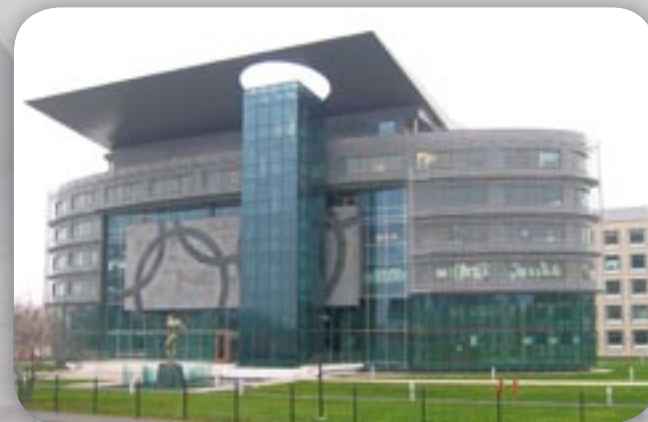
Olympic Center | Warsaw AlkorPlan® F - 2004