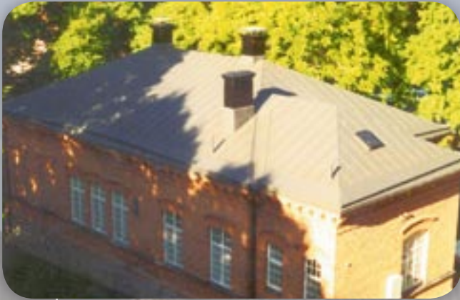
Office Hospital | Stockholm (Se) AlkorDesign® - 2000