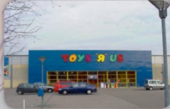
Toys "R" us | Greve (Dk) AlkorPlan® F - 2004