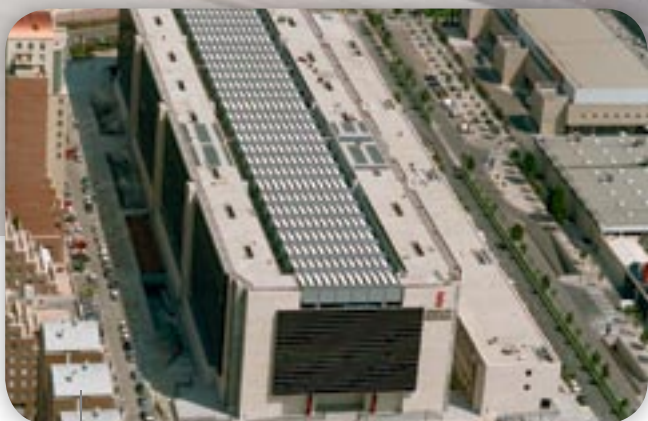
Ciudad de la Justicia | Valencia AlkorPlan® L - 2002-2003