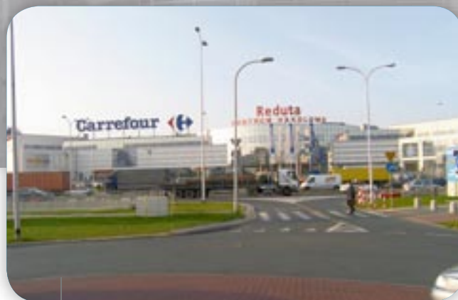
Shopping Center Reduta II | Warsaw AlkorPlan® F - 2004