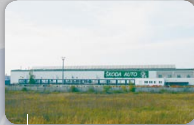
Škoda Auto | Mladá Boleslav AlkorPlan® F - 1995