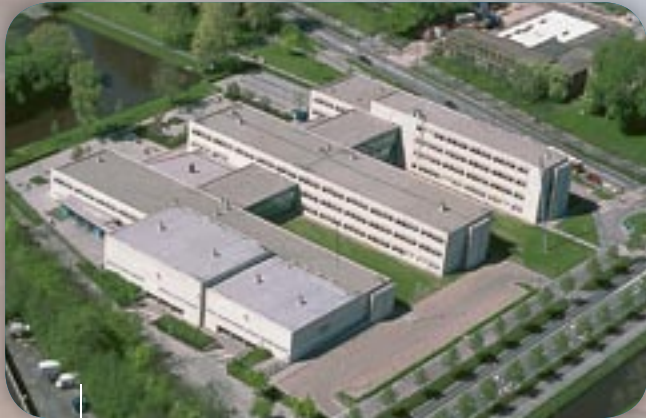
Van Egmond College | Purmerend (NL) AlkorPlan® L - 1995