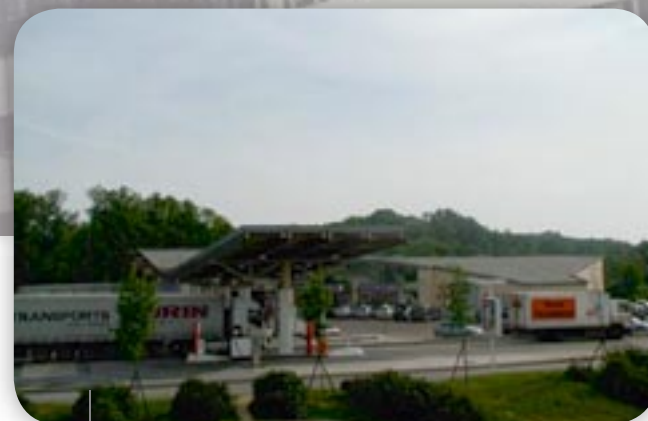
Station Total | Corrèze AlkorDesign® - 2002