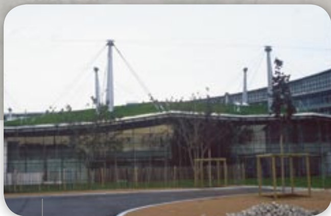
Cité Scolaire Internationale | Lyon AlkorPlan® L - 1993