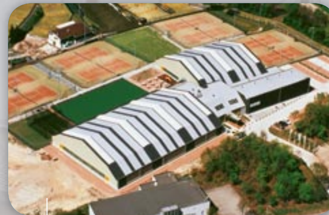
Sporthal "De Wolfkamer" | Huizen (NI) AlkorPlan® F - 1998