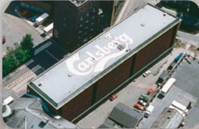
Carlsberg Brewery | Copenhagen (Dk) AlkorFlex® - 1996