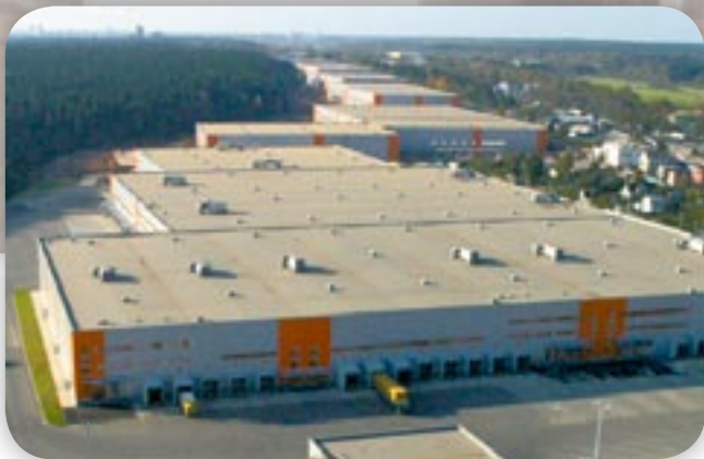
Warehouse complex MLP | Moscow region AlkorPlan® F - 2006 (ca. 200.000 m²)