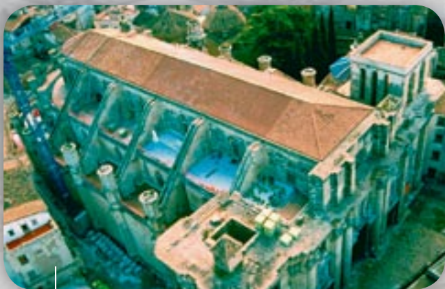
Catedral de Tortosa | Tarragona AlkorPlan® F - 1998