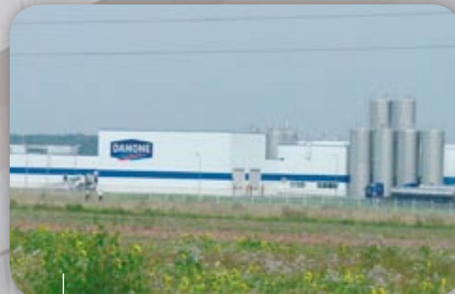
Danone | Moscow AlkorPlan® F - 2002-2003