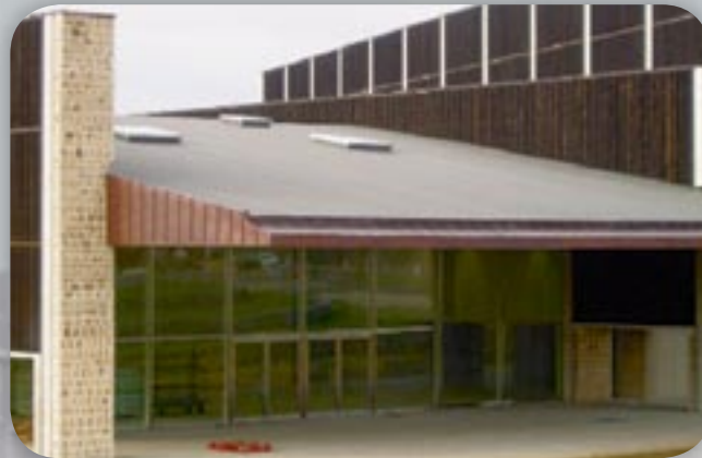
Bocapole | Bressuire AlkorPlan® F - 2004