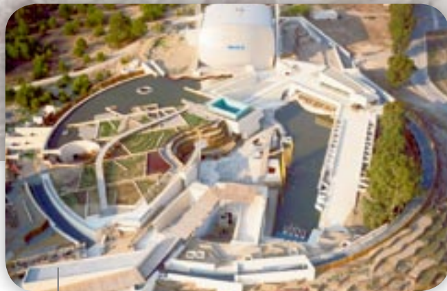
Centro Multimediale | Taranto AlkorPlan® L - 2002