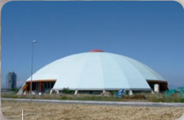
Palazzo dello sport | Livorno AlkorPlan® F - 2003