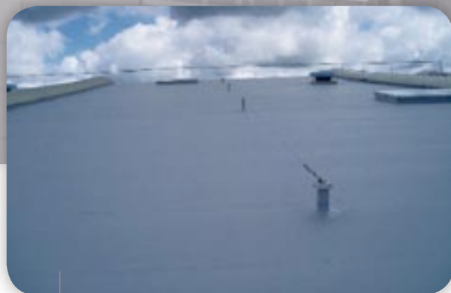
Plastic Omnium | Le Havre AlkorPlan® F - 2004