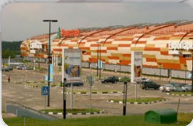
Trade entertainment center EUROPARK | Moscow AlkorPlan® F - 2004-2005