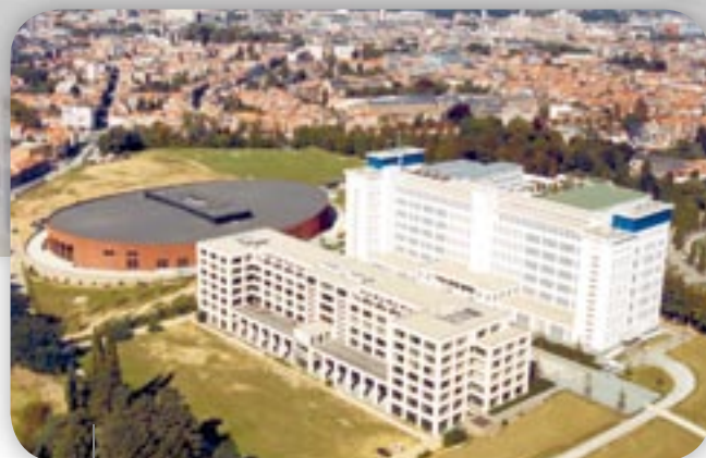
Sportplaza | Leuven (B) AlkorPlan® F - 2005