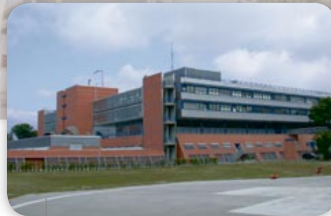
Ospedale della Versilia | Viareggio AlkorPlan® F - 2006