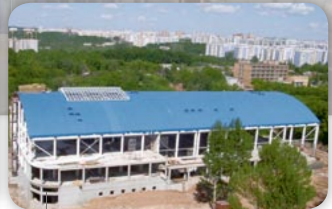
Sports Center | Samara AlkorPlan® F - 2001