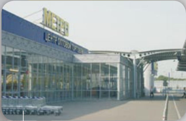
Metro Shopping Center | Moscow AlkorPlan® F - 2003