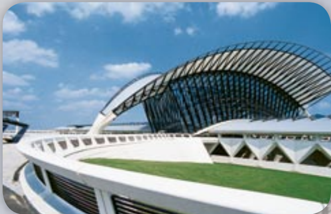
Gare Aéroport Satolas | Lyon AlkorPlan® F - 1995