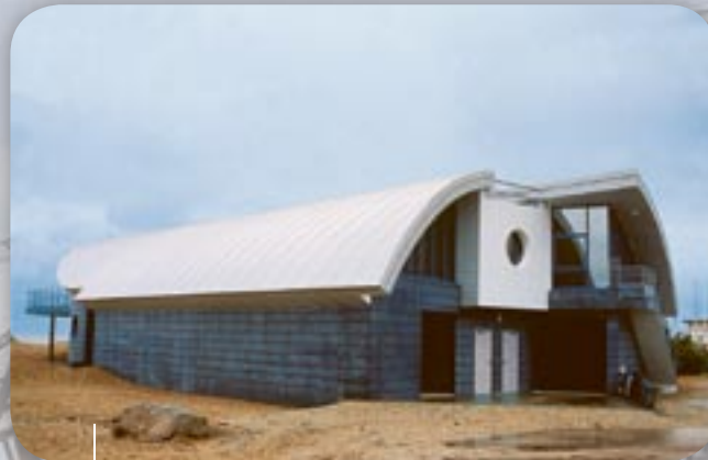
Ecole de Voile | Courseuil-sur-Mer AlkorDesign® - 1997