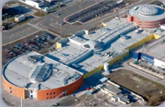
Soravia | Bratislava AlkorPlan® F - 2004