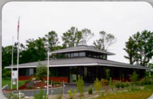
Imprimerie | Bordeaux AlkorDesign® - 2003