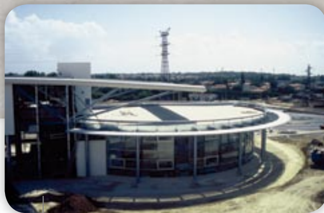
Lycée Champlain | Royan AlkorPlan® F - 1998