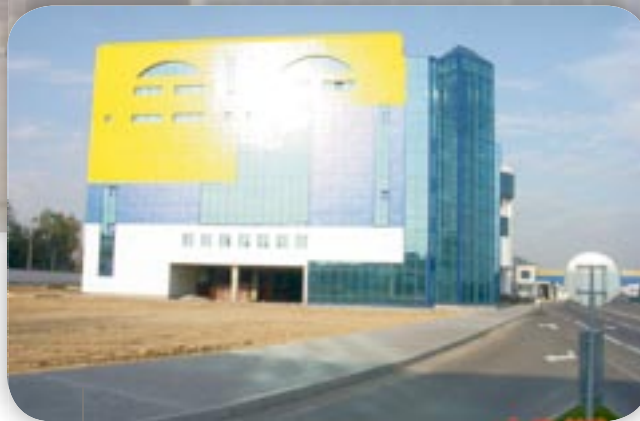
Podvorie-office/shopping centre | Minsk AlkorPlan® F - 2005