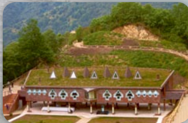
Centro de Interpretación de la Naturaleza | Muniellos AlkorPlan® L - 2003