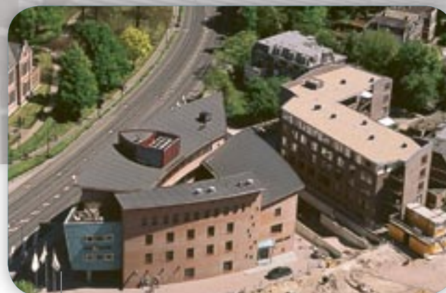
ING Bank | Amersfoort (NI) AlkorDesign® - 1998