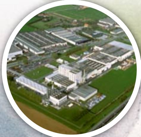
RENOLIT Production unit Oudenaarde (Belgium)