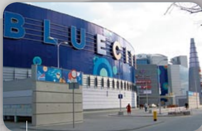
Blue city | Warsaw AlkorPlan® F - 2003