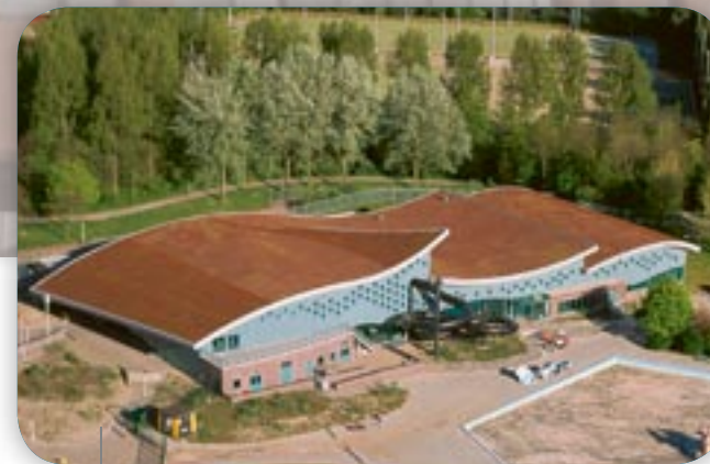
Zwembad "Het Keerpunt" | Zoetermere (NL) AlkorPlan® F - 1998