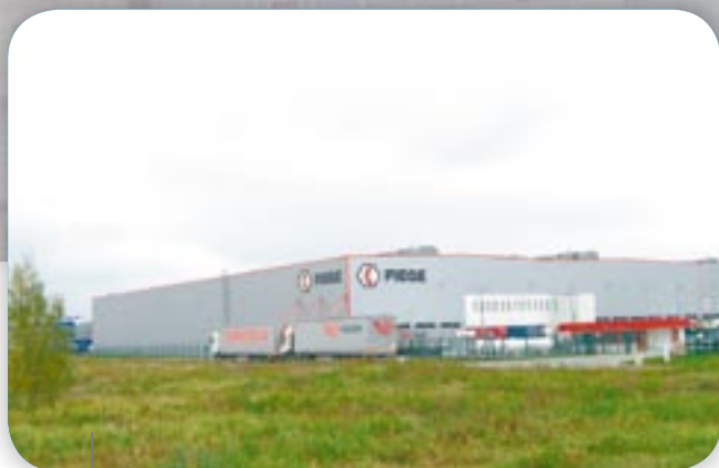
Fiege | Mszczonow AlkorPlan® F - 2004