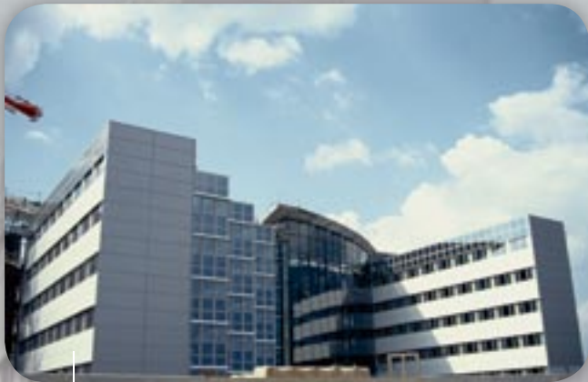
Airbus Industries | Blagnac AlkorPlan® F - 1993