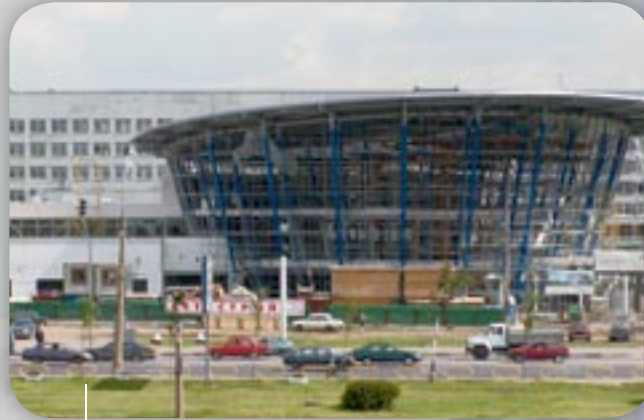
Mercedes Benz | Moscow AlkorPlan® F - 2002