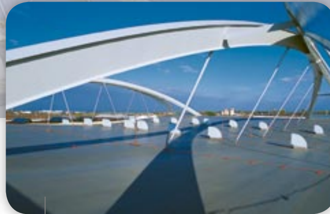
Transport Station | Praha AlkorFlex® L - 1994