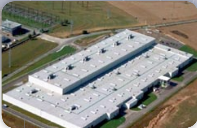
Futuba | Havlíčkův Brod AlkorPlan® F - 1980