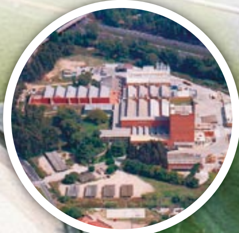
RENOLIT Production unit Sant Celoni (Spain)