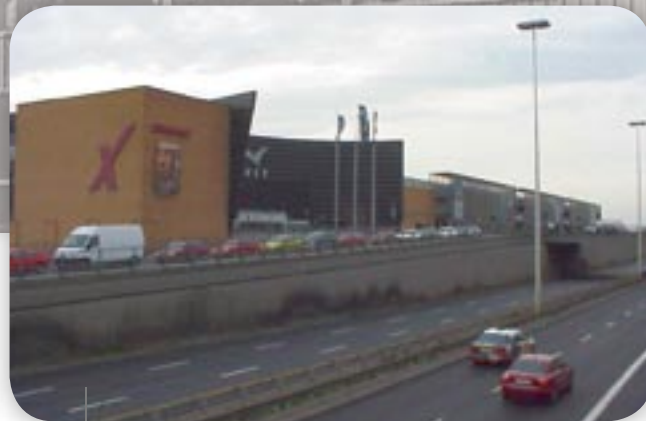
Fisketorvet Shopping Center | Copenhagen (Dk) AlkorPlan® F - 1999-2000