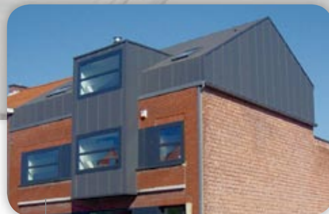
Privé woning | Tongeren (B) AlkorDesign® - 2003