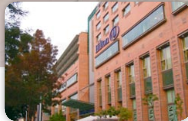
Hilton Westend | Budapest AlkorPlan® L - 1999