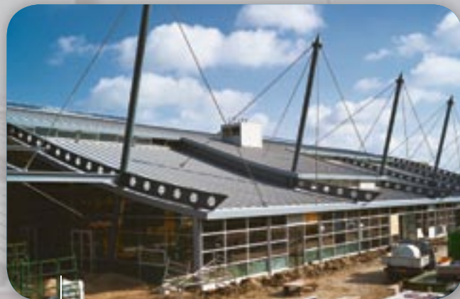
Da Vinci College | Gorinchem (NI) AlkorDesign® - 2000