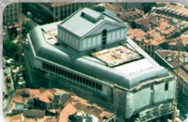
Teatro real | Madrid AlkorPlan® L - 1992-1993