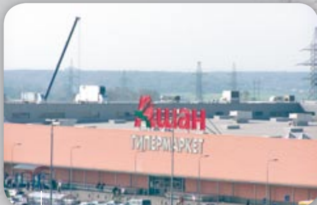
Auchan | Moscow AlkorPlan® F - 2003