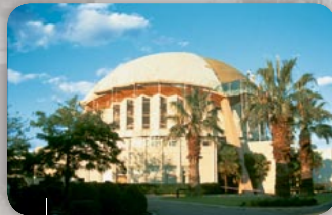
Théâtre CNRO | Foelli AlkorPlan® F - 1994