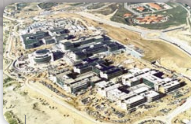
Ciudad Financiera | Madrid AlkorPlan® L - 2005