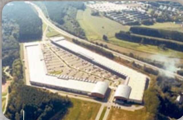
Shoppingcenter | Arlon (B) AlkorPlan® F - 2004