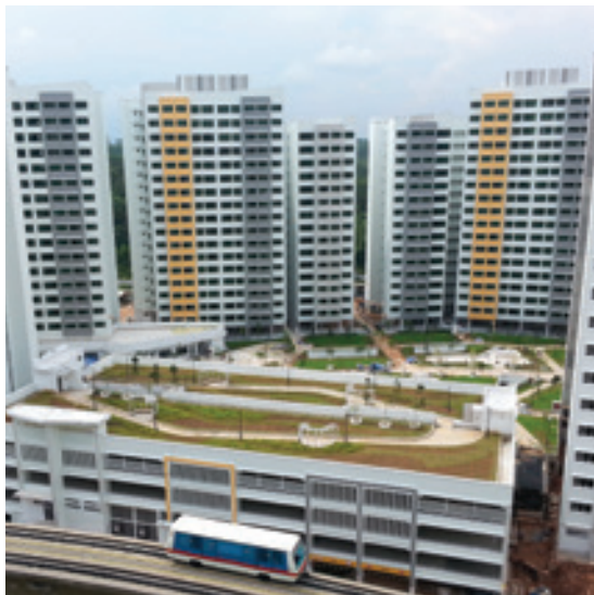
HDB Bukit Panjang (Singapore)