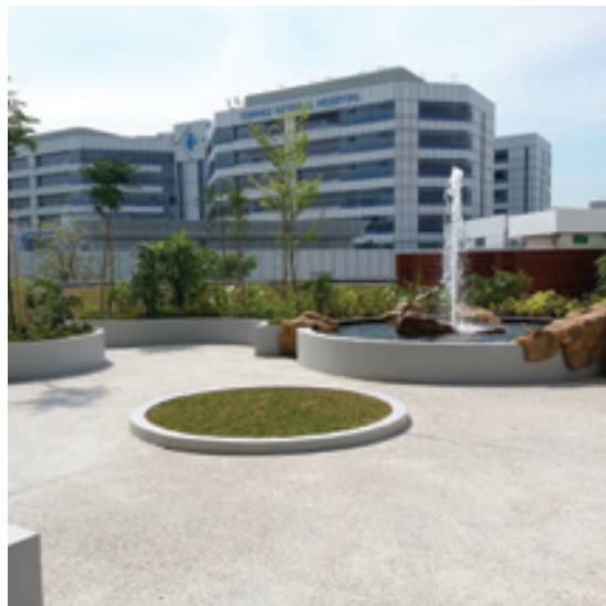
St Andrew's Community Hospital (Singapore)