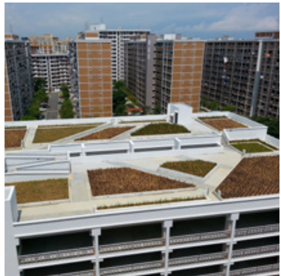
HDB Tampines (Singapore)