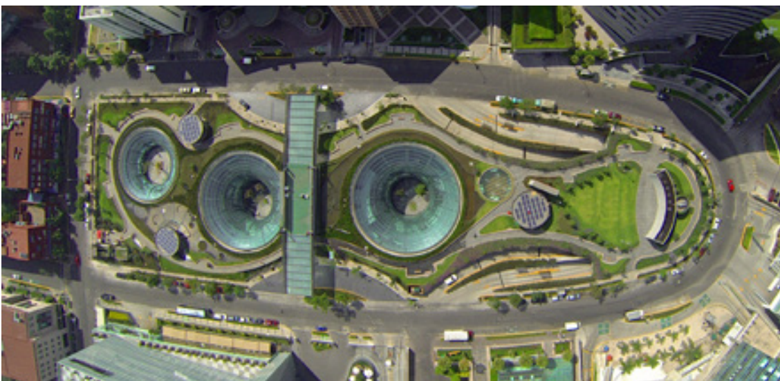
Roof garden Stafe Santa Fe (Mexico)

Store dry. Rolls to be parallel and in original packing where possible, do not stack in cross form or under pressure.