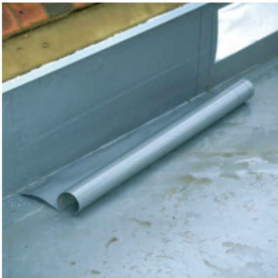
Edge restraint with RENOLIT ALKORPLAN 81170 metalsheet

RENOLIT ALKORPLAN 81170 or 81171 metal sheet is preformed to obtain a minimum width of 70 x 70 mm for an L-shaped profile. These profiles are pre-fixed to the supporting deck. The maximum distance between fixings is 250 mm with fixings on one face only of the RENOLIT ALKORPLAN metal sheet and in zig-zag formation to resist a continual tensile load of 2.7 kN/m. If RENOLIT ALKORPLAN metal profiles are fixed in the vertical leg, fasteners will be at 200 mm distance.