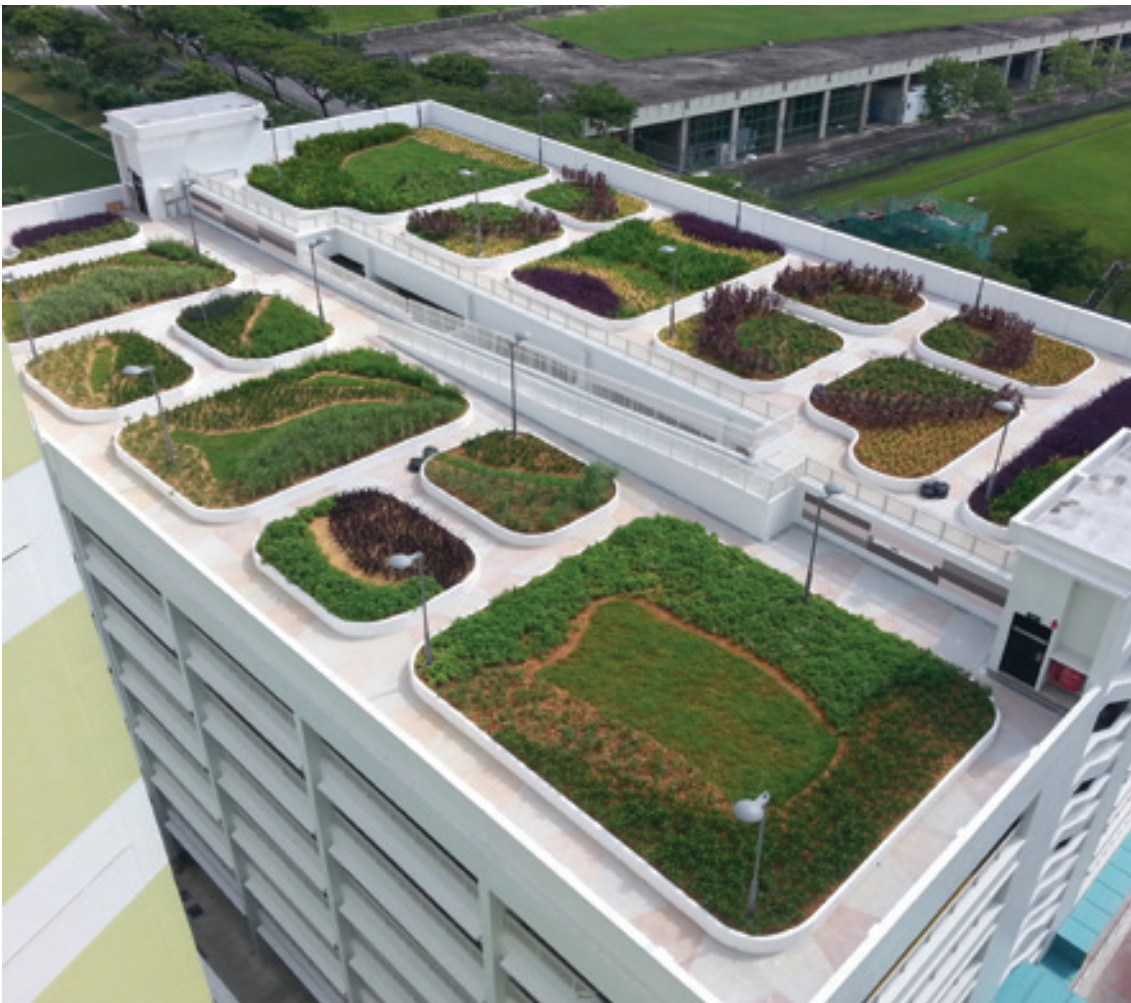
HDB Sengkang (Singapore)

A concrete supporting structure should comply with the minimum quality according national legislation (or in absence of this according to British Standard BS 8110 part I 1985 and I.S.326:1995). The surface is to be smooth without protrusions or irregularities over 2 mm (ideally power floated).